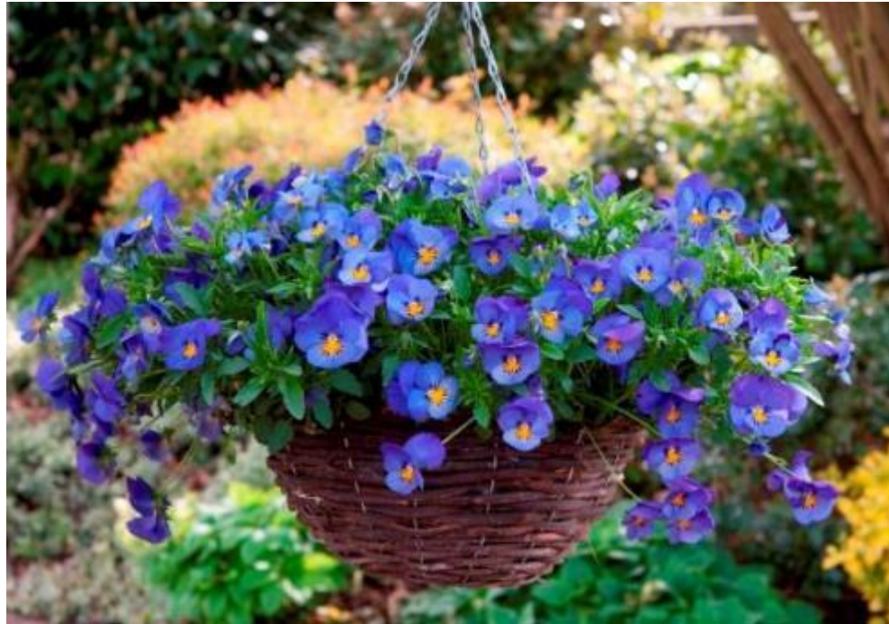
Cool Wave Blue Skies

With the Cool Wave Promotional campaign we want to increase the attractiveness of Cool Wave and encourage consumers to pick these unique, trailing pansies above others!