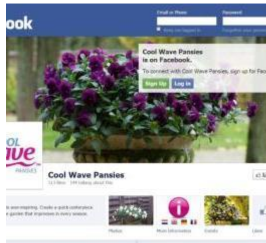
Social Media Promotional Campaign